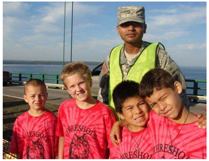
Five Threshold Academy students, a few parents and an aide took part in an annual Michigan tradition, a five-mile walk across the Mackinac Bridge this past Labor Day. The students earned the trip "up north" by being the top walkers in the Mileage Walkers Program at Threshold Academy, Orleans.