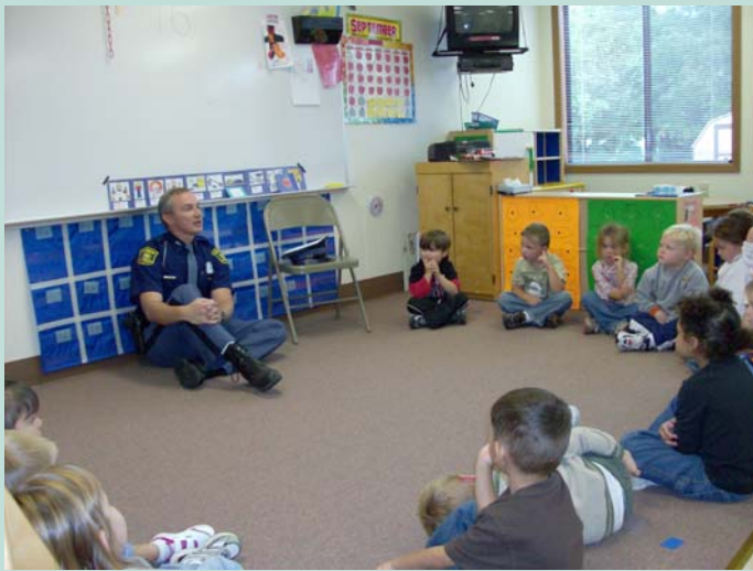
Bicycle safety events were held at Greenville I and Greenville II centers.

Head Start is a comprehensive child development program for children 0-5 years who either live in poverty or have a certified special need. With the goal of school readiness and family self-sufficiency, Head Start, Early Head Start, and the Michigan School Readiness Program combine local, state, and federal resources to deliver an array of individually tailored educational and social support services.