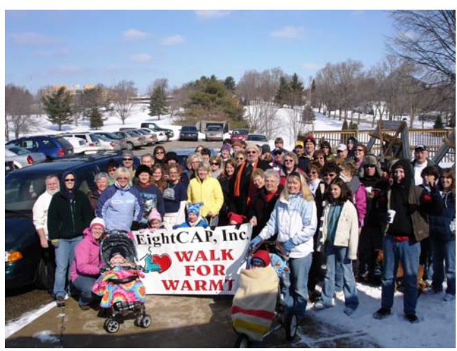
Two Walk for Warmth events, one in Greenville and the other in Alma, helped to generate more than $15,000 in donations to help needy families pay their utility bills.