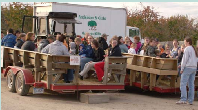
Parent meeting held at Anderson & Girls Pumpkin Patch.